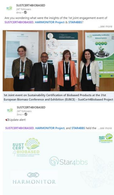
Figure 2 Cluster events disseminated through social media networks

All three projects work under the same vision and contribute to a faster green transition! Stay tuned to find out more about our joint events and activities!!